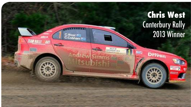
Chris West Canterbury Rally 2013 Winner